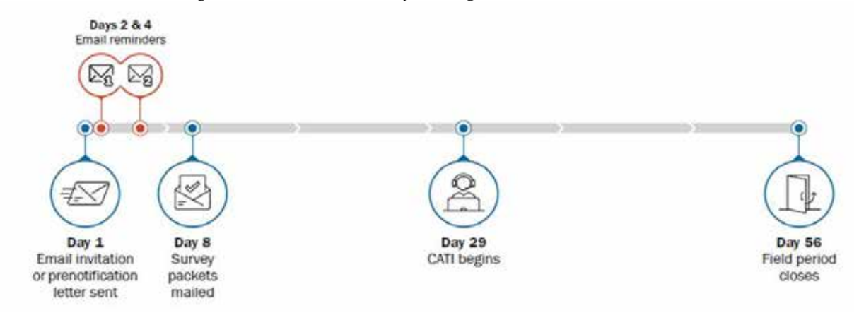
Figure 2. Recommended Survey Fielding Procedures

4. Four weeks after initial email invitations or mailed prenotification letters are sent, active cases move to the CATI component of data collection. Up to eight attempts are made to contact the patient and complete the interview over the telephone, with a ninth attempt possible if the eighth resulted in a firm callback. After eight attempts over four weeks are made to contact the patient, the case is considered a "non-response."