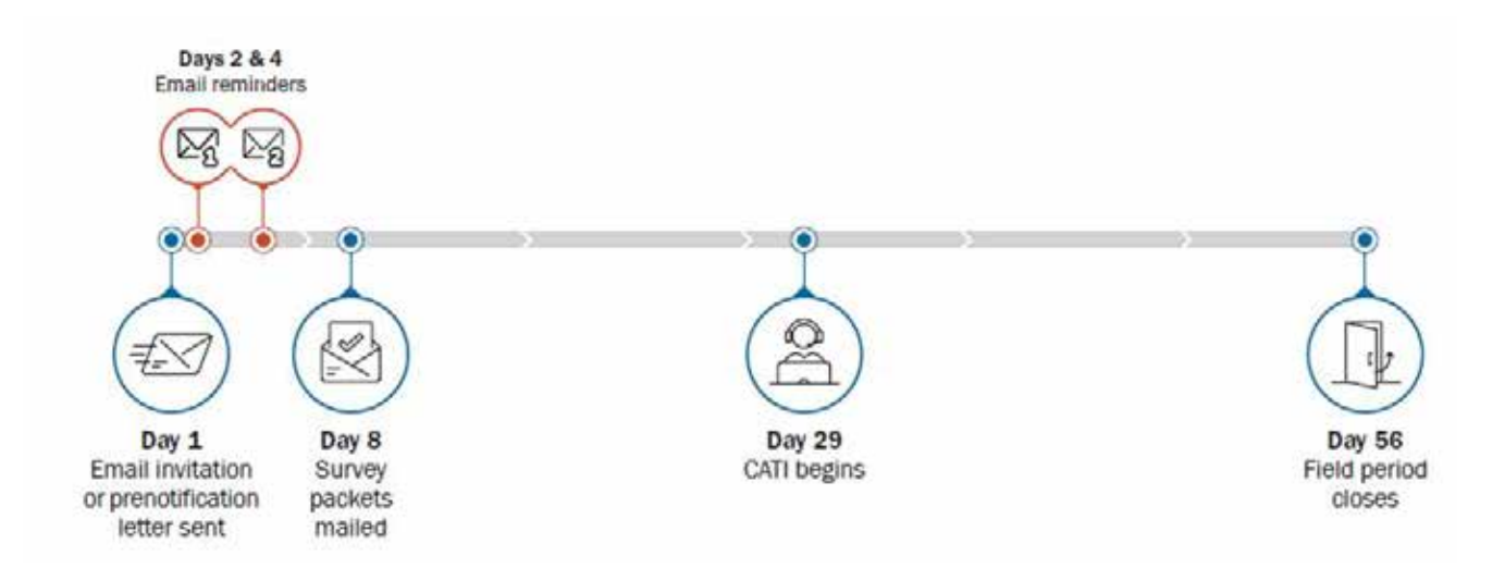
Figure 2. Recommended Survey Fielding Procedures

4. Four weeks after initial email invitations or mailed prenotification letters are sent, active cases move to the CATI component of data collection. Up to eight attempts are made to contact the patient and complete the interview over the telephone, with a ninth attempt possible if the eighth resulted in a firm callback. After eight attempts over four weeks are made to contact the patient, the case is considered a "non-response."